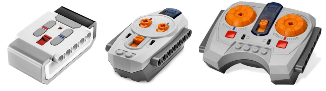
Figure 2 «Examples of IR-remote control devices»

Therefore, robots controlled from IR-remote control devices are not allowed for using during the competition.