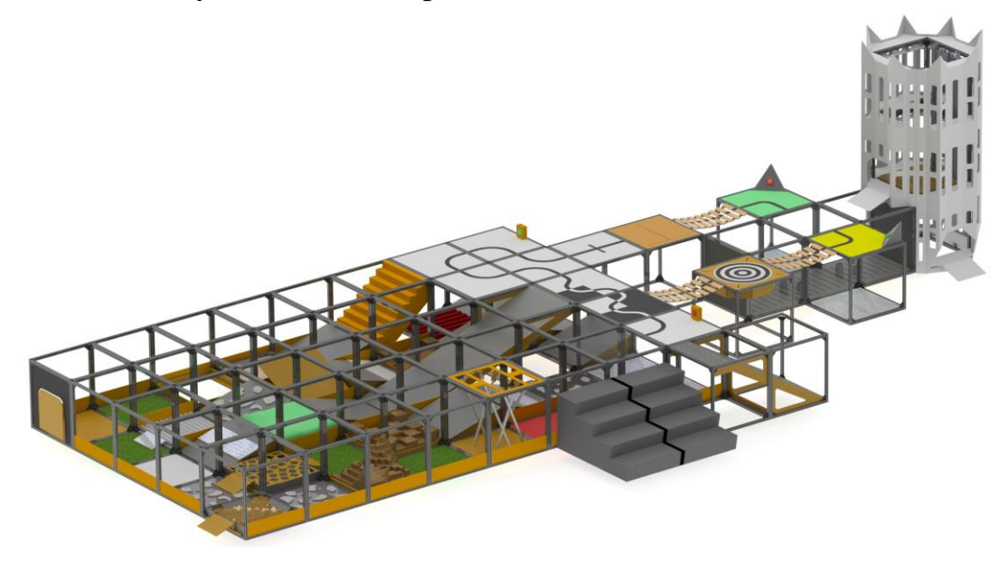
Figure 1 «Example of a test area configuration»